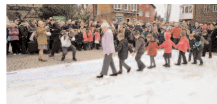
Walking the map at the launch of the South Downs National Park

Around 1,000 people gathered in the historic market town of Petersfield in celebration of the official opening of the South Downs National Park in The Square on 1st April.