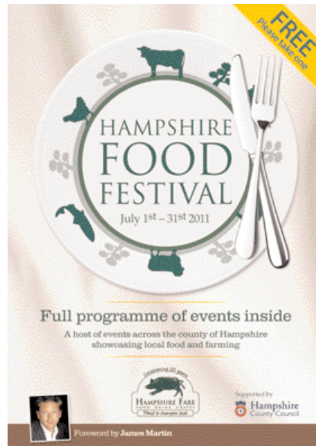
The Hampshire Food Festival 2011 programme is packed full with over 90 different events taking place throughout July

Basingstoke's Festival Place Food Festival is a key event during this year's Festival, and is a positive outcome of the ongoing corporate partnership between county food group Hampshire Fare and one of the south's leading shopping centres. This year celebrity chef Anthony Worrall Thompson will be at the free Festival Place Food Festival on both Saturday 16th and Sunday 17th July, showing how easy it is to cook simple seasonal dishes using locally sourced ingredients.