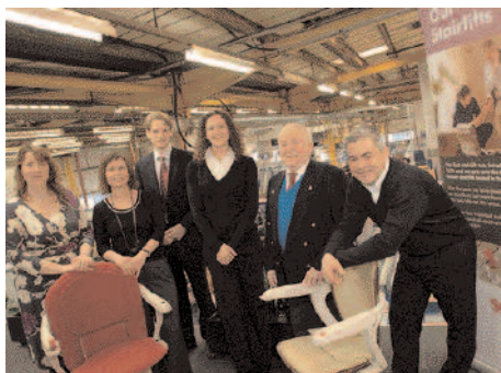
The Hampshire Ambassadors visit Stannah in Andover

During the Daily Echo tour Ambassadors were enthralled by the state-of-the-art presses, witnessing the following day's paper being written before their very eyes, and viewing newspapers which dated back to 1888, covering the infamous Whitechapel murders.