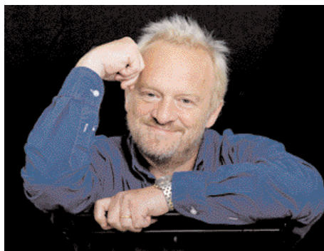
Anthony Worrall Thompson @ Festival Place

Held at numerous venues across Hampshire on the south coast of England, the Hampshire Food Festival celebrates the food and drink produced, reared and grown in the county with over 90 different events: farm open days and walks; brewery, vineyard, orchard and lavender tours; celebratory lunches and dinners; butchery and fish filleting demos, cookery classes; jam, chocolate and cheese-making; milling and baking; cider pressing; trout and venison farming; foraging; beekeeping; cookery competitions; tastings and much more.