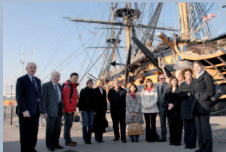
Delegates of Discovery 2011 visit Portsmouth Historic Dockyard

Over 100 delegates from around the world, including senior buyers from the UAE and China, attended Discovery 2011 in February. Discovery 2011 is a biannual meeting which showcases the UK's conference industry, and Conference Hampshire was there to promote all that the county has to offer.